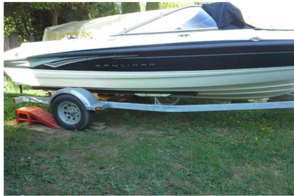
2008 19' Bayliner 195 Bowrider HIN: USHE57GRE808

Police File #2014-7491, Mission RCMP Our File #8892