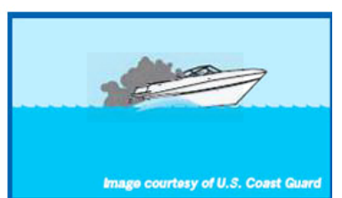
Back drafting can occur when a boat is operated at a high bow angle.