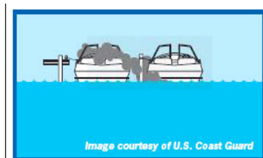
Exhaust from nearby vessels can send CO into your boat's cabin or cockpit.