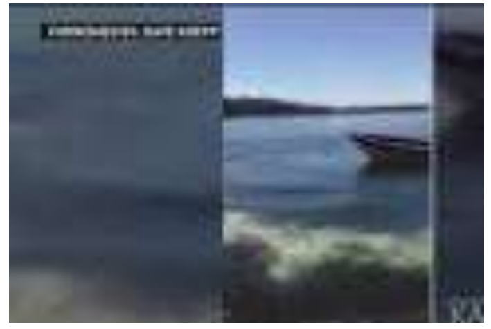
Click to watch news interview of survivor of Circle of Death incident on Pokegama Lake, Grand Rapids, Minnesota