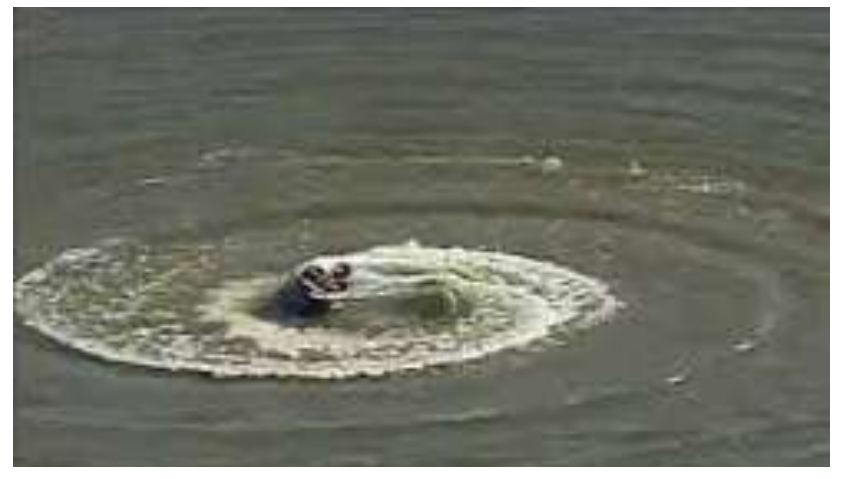
Click to watch news footage of Circle of Death on Claremore Lake, Oklahoma

On Wednesday, November 14<sup>th</sup>, the Vancouver Police Marine Unit and crews from the Canadian Coast Guard, Kitsilano Base, responded to a report of an unoccupied vessel running in circles in Coal Harbour. The VPD Marine Unit was able to determine that the occupant of a small "coach boat" had fallen overboard and had been recovered by another coach boat in the area. It was also determined that the operator was not wearing a "KILL SWITCH". Fortunately there were no injuries in this incident. Several people are killed or seriously injured every year as a result of being thrown out of their vessel and subsequently run over as their vessel circles around them in what is referred to as "The Circle of Death". Wearing a kill switch connected to your vessels ignition can prevent the "Circle of Death".