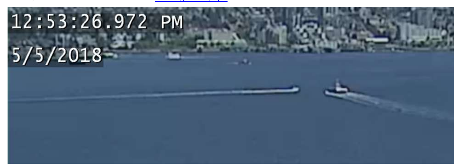
TC Boating Safety Guide

On Saturday May 5<sup>th</sup> at 12:53 pm, the Sea Bus, Burrard Otter II, was approximately half way across Vancouver Harbour enroute to North Vancouver, when the Master observed an eastbound pleasure craft approaching the side of the Sea Bus at approximately 30 knots (55 km/h). The approaching pleasure craft, who was required by the Collision Regulations to "Give Way" to the Sea Bus, continued on its course and speed putting it into a collision course with the Sea Bus. The Master of the Sea bus sounded his horn several times to alert the approaching pleasure craft of the impending collision, but the pleasure craft continued to adjust its course to align itself directly with the "mid ships" of the Sea Bus. When the pleasure craft was approximately 600 feet away, the master of the Sea Bus executed an "Emergency Stop", which resulted in the pleasure craft passing within 30 feet of the bow of the Sea Bus and continued eastbound through the harbour. The pleasure craft was observed to have two males and a female aboard and is described as 28-32 feet, white Sport Fish style with twin black outboards. The Burrard Otter II had 205 passengers and 4 crew members. The Vancouver Police Marine Unit is attempting to identify the vessel and is requesting any passengers or other witnesses that may have captured a photo of the incident or can provide a description of the vessel, to contact Cst Jamie Gibson at Jamie.gibson@vpd . File 2018 -89766